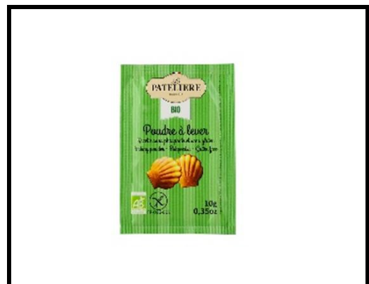
1 sachet de levure