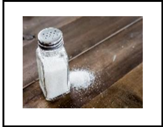
1 pincée de sel