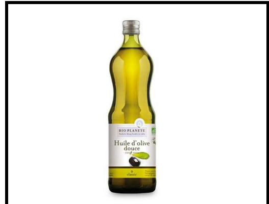
1/2 verre d'huile