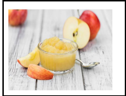
2 pots de compote