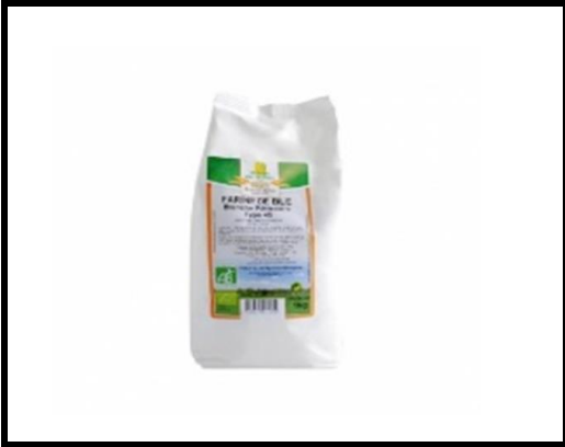
4 pots de farine