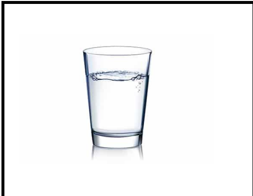
8 C. soupe d'eau chaude