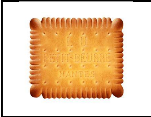
2 paquets de biscuits