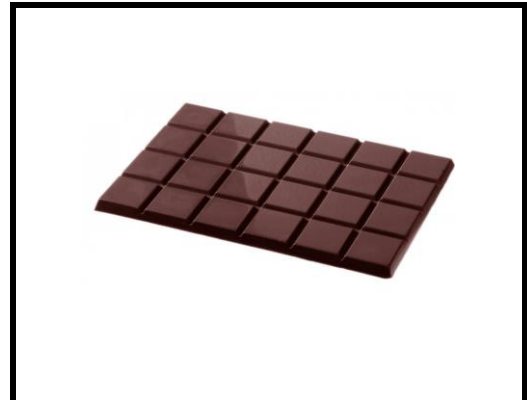
100g de pépites