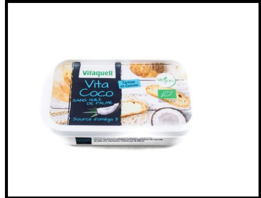
120g de beurre